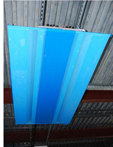
Figure 4: Chilled Beam at the URBN Center

Using an active chilled beam system was a major value engineering decision for the owner. With over 100 buildings under the owner's operation, the URBN Center was the first building to use a chilled beam system. Therefore, the owner was hesitant to use this type of system because of the unfamiliarity with how the chilled beam operates and what the cost of operation will be like in the long run. Also, supply chain is one of the main critical industry issue that was discussed during the PACE Roundtable. Therefore, this research is pursued to gain a better understanding of supply chain and how it would be best utilized on a unique product such as chilled beams.